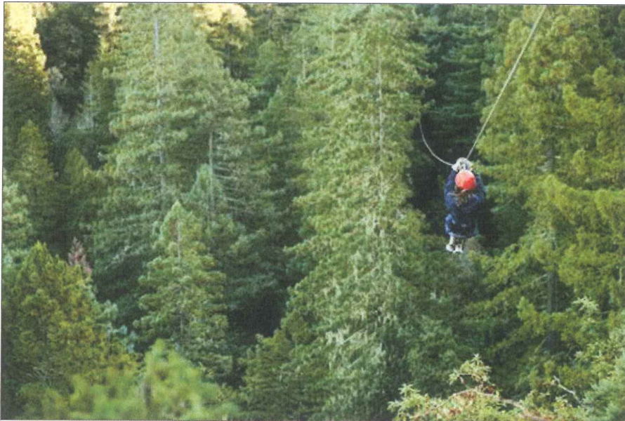
The view from Sonoma Canopy Tours

Bay Area urbanites are escaping to the forest to dangle from cable-thin ropes as they take death-defying, high-speed leaps into nothingness. And the scenery is pretty rockin' too. From Wine Country to Gold Country, Tahoe to Santa Cruz, we've got a birds-eye view on the best ziplining adventures in Northern California.